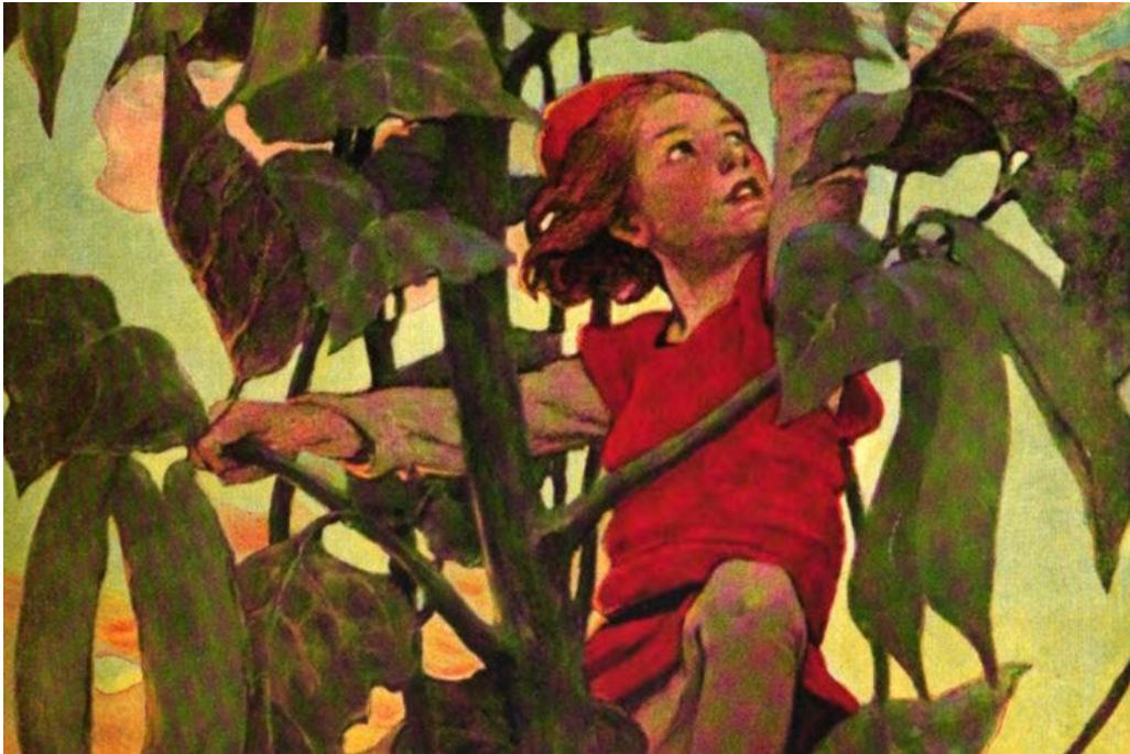
Illustration by Jessie Willcox Smith (1911)

Once upon a time there lived a poor widow and her son Jack. So goes the old 'Jack and the Beanstalk fable.' One day, Jack's mother told him to sell their only cow. Jack went to the market and on the way, he met a man who wanted to buy his cow. Jack asked, "What will you give me in return for my cow?" The man answered, "I will give you five magic beans!" Jack took the magic beans and gave the man the cow. What a trade! Jack's mother was incensed and heartbroken. 'We can't live on these' she screams and throws them out the window. Except that those five beans end up sprouting into a beanstalk that reaches to a kingdom in the sky, which opens undreamed-of possibilities.