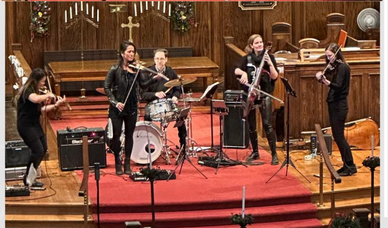
Devah Quartet - December 2024