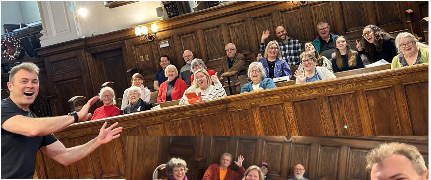
Choir Practice Selfies